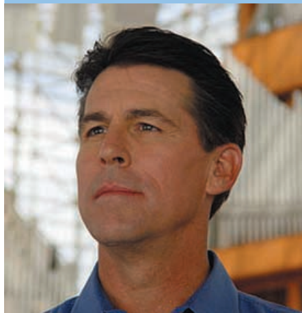
Rev. Robert Schuller