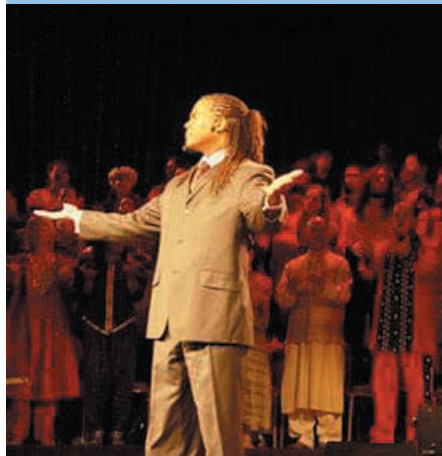
Michael Bernard Beckwith